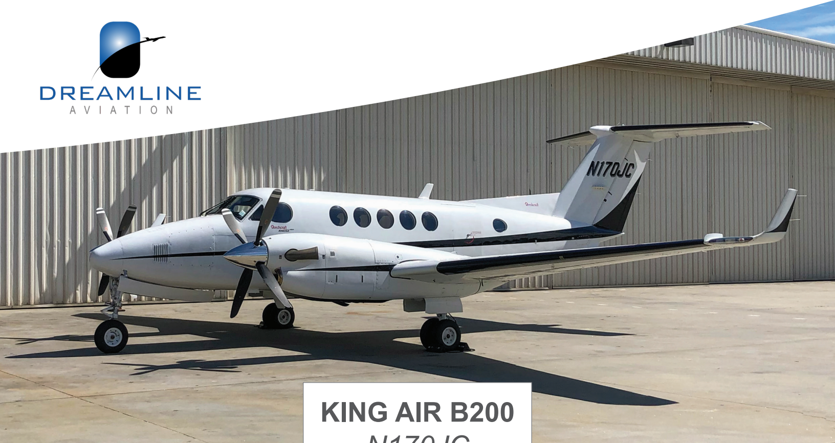
KING AIR B200 N170JC